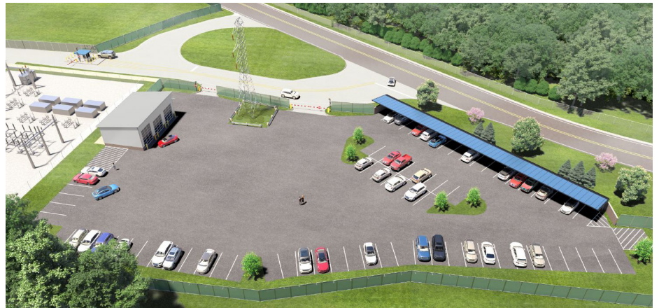
Conceptual illustration of the proposed ACM EV Charging & Interoperability Testbed

The rapid shift to vehicle electrification with a quickly expanding number of electric vehicles and EVSE charging stations from a variety of manufacturers brings with it significant challenges, particularly around ensuring all platforms work seamlessly. The ACM EV Charging & Interoperability Testbed will address the critical need for interoperability testing and collaboration.